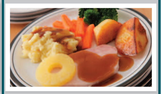
Roast of the Day served with Roast/Mashed Potatoes, Seasonal Vegetables & Gravy