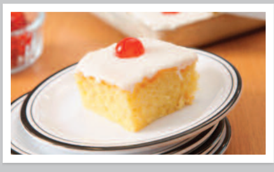
Iced Sponge Cake