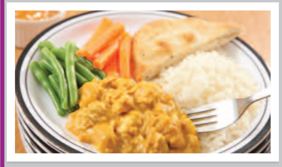
Chicken Korma served with Rice. Naan Bread & Seasonal Vegetables