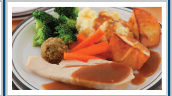
Roast of the Day served with Roast/Mashed Potatoes. Seasonal Vegetables & Gravy